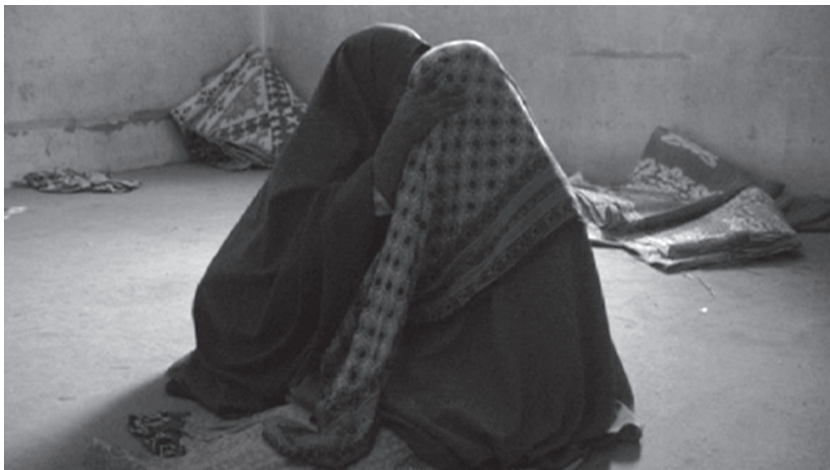
Picture 2: Treatment method of the medicine of the Sunna . The patient (right) with her legs stretched toward Makka, and the practitioner (left) as he recites the Qur'an near the patient's ear (Nungwi, December 25, 2007).

After a few days, another attempt was made to treat her. Again, when the Qur'an was recited near her ears, she began to cry loudly. The more she was held down, the more violently she acted. Eventually, she began to bite the arms and hands of the people who held her. The treatment continued for more than two hours, and finally, their efforts were successful as the jini began to reveal who he was. According to one of the practitioners, her jini was brought by Indian man, who lived in Bububu (a town located north of Stone Town). This man desired to marry her, but could not. Consequently, he became jealous of her and her husband. During the treatment, the jini clarified who he was and was persuaded by the practitioner to leave. Finally, the jini promised to leave her body (Michenzani, January 6 and 9, 2008).