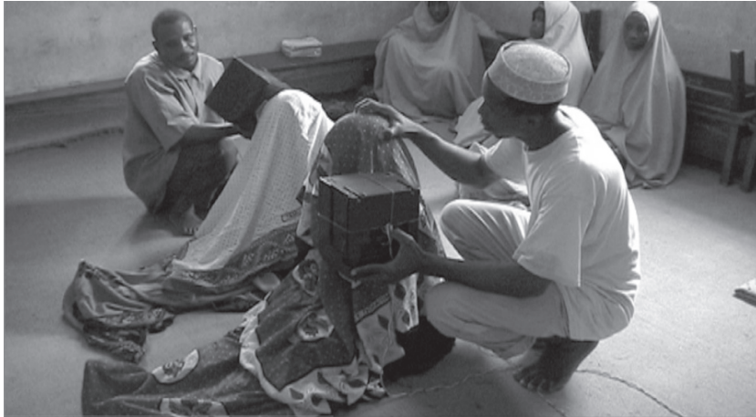
Picture 3: Practitioners of the medicine of the Sunna placing a speaker on a patient's body (Nungwi, December 25, 2007).

removed. Further, if a patient is unfamiliar with the verses from the Qur'an and the manner of recitation, he/she is recommended to listen to Qur'anic CDs or cassettes at home. On the other hand, the practitioners of uganga do not utilize Qur'anic CDs and cassettes. It appears that the practitioners of uganga place more emphasis on the knowledge that they have succeeded over generations.